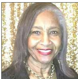
By Dottie Chapman Reed

My grandmother worked long hours every day but as soon as she got home, she would tend the flowers she planted in pots